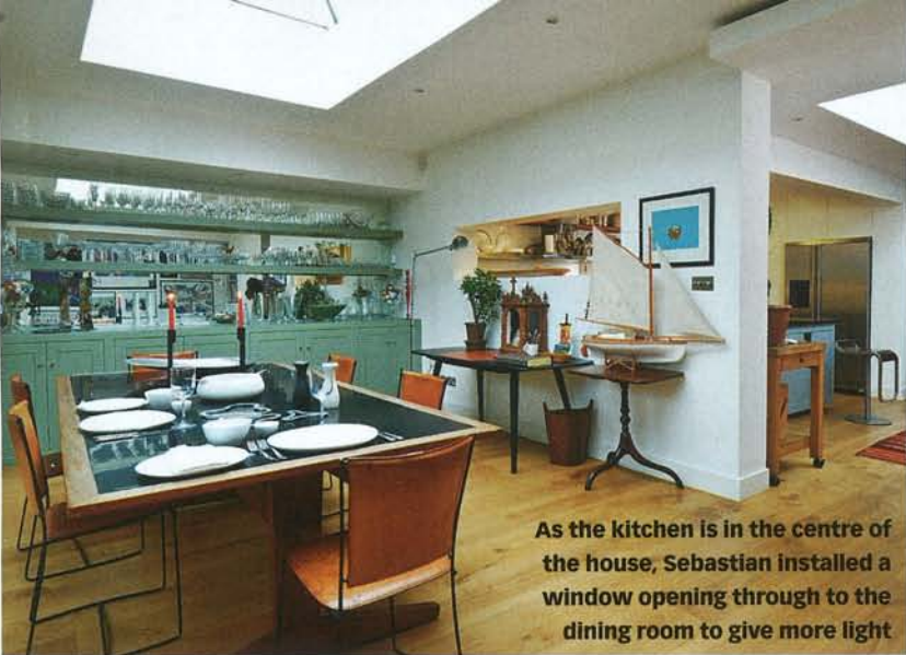
As the kitchen is in the centre of the house, Sebastian installed a window opening through to the dining room to give more light

A spray nozzle on a tap makes cleaning the sink much easier. Franke Swing Spray in chrome, £257.33. 0161 436 6280, frankeonline.co.uk