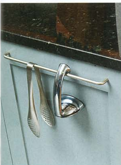
LEFT Cloths and kitchen utensils can be hung on the long drawer handles RIGHT The self-shutting, two-way restaurant door to the kitchen leads to Sebastian's well-stocked and accessible larder cupboard