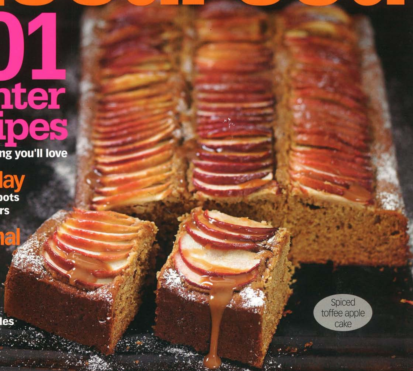
Spiced toffee apple cake

Seasonal dishes • Sausages • Bonfire treats • Warming soups & sides